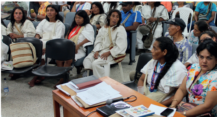
Indigenous victims of the conflict participate in a court case concerning their compensation.

These achievements were highly recognized by the Colombian partners. Germany has been invited to be part of the group of countries that will accompany the coming transitional justice process regarding demobilized FARC combatants.