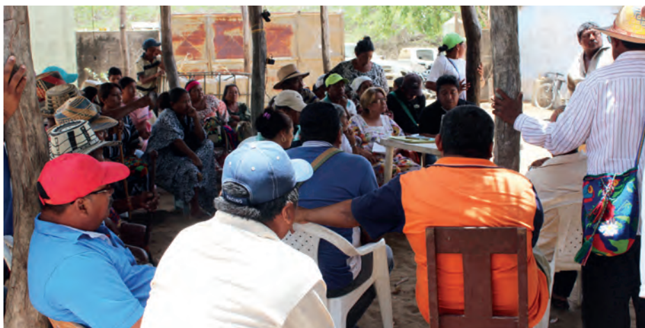
Indigenous people of the Wayuu people gather to learn about their rights in the transitional justice process, Puerto Nazareth.

Communication by authorities with victims in the country's remote areas was made possible through the purchase of several mobile satellite transmission stations by ProFis. This was a measure of fundamental importance and was subsequently replicated by other agencies such as IOM, USAID and UNDP. ProFis also supported the Defensoría in disseminating information about the Justice and Peace Law and the rights of victims across the country, particularly in remote areas.