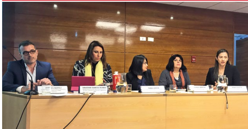
NHRIs presenting in the IV Regional Consultation on Businesses and Human Rights.