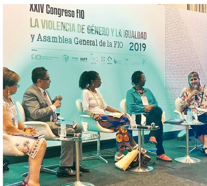
Panel on gender equality in XXIV FIO Congress, Brazil 2019.

In its third phase (2019 – 2022), the MinSus programme is building on the lessons learned and is aiming at mainstreaming human rights further, both internally and externally. The human rights component focuses on strengthening citizens’ access to grievance mechanisms in mining contexts, with a two-fold aim: On the one hand, by enabling duty bearers (mainly mining and environmental authorities) in mining contexts to fulfil their responsibilities. On the other hand, by empowering rights holders (communities affected by mining and civil society as a whole) to assert their