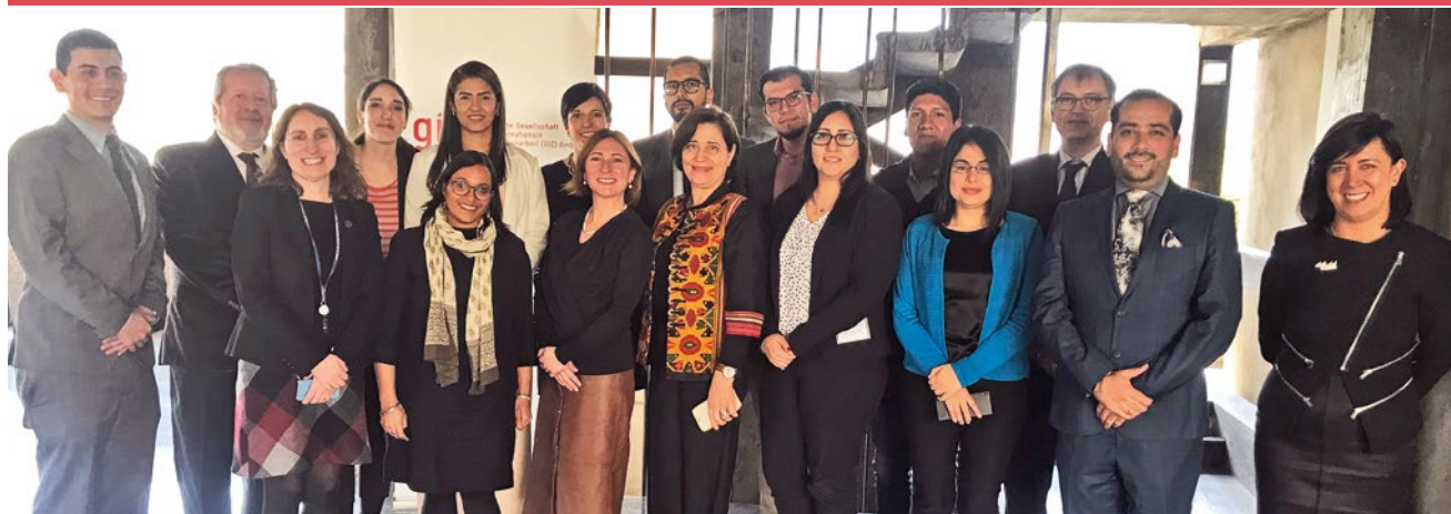
NHRIs workshop, September 2019.