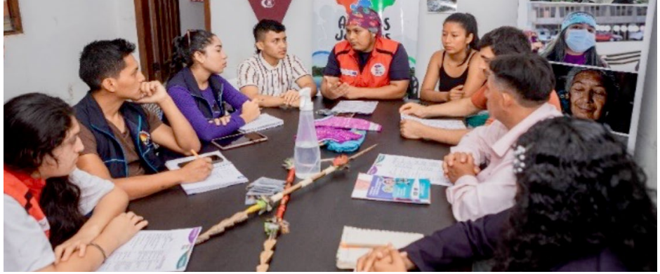
Youth build their action agendas in Sucumbios