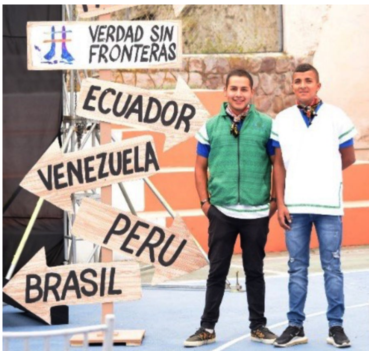
Verdad sin Fronteras, event with survivors of the Colombian armed conflict and the host community in Ecuador

In Ecuador, SI FRONTERA engages with youth and youth organizations in developing “Youth Agendas” . The goal is to empower youth of the northern border of Ecuador, to recognize themselves in their diversity and to propose ideas to promote and exercise their rights. The “Youth Agendas” provide a tool to empower young people and to strengthen their capacities.