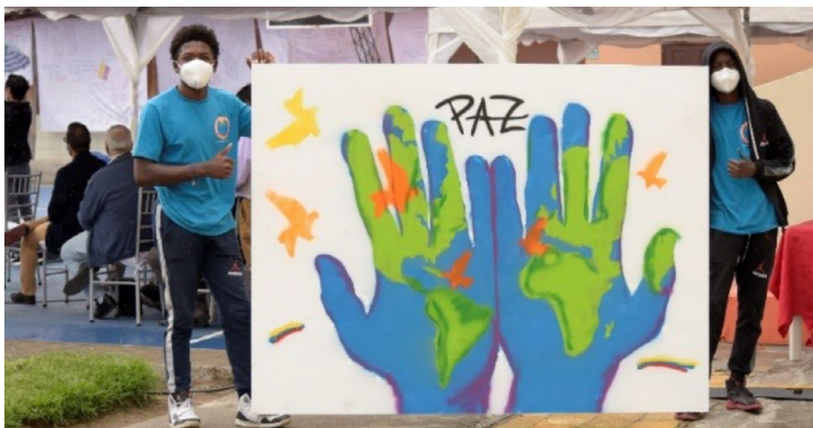
Verdad sin Fronteras, event with survivors of the Colombian armed conflict and the host community in Ecuador